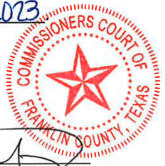
Signature of County Judge